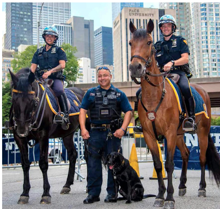
EP Great Drive (R) is a lucky guy! Rescued from slaughter by SRF, this older teenager has been wearing his badge for the New York Police Mounted Unit. Genius At Work (L), another SRF adopted mount made the NYPD Foundation Calendar for 2023!

This is a tough mission, until the Safe Act or any legislation changes the outcome for these beautiful animals, the size and scope of the work at SRF depends on the support received. Horses under SRF's expense and care, in homes, standing on slaughter lines hoping for help are the top priorities. Every day is filled with these needs. These gifts mean the world to these horses. We also received a matched offer for much needed hay. When we heard that our hay (continued on pg 3)