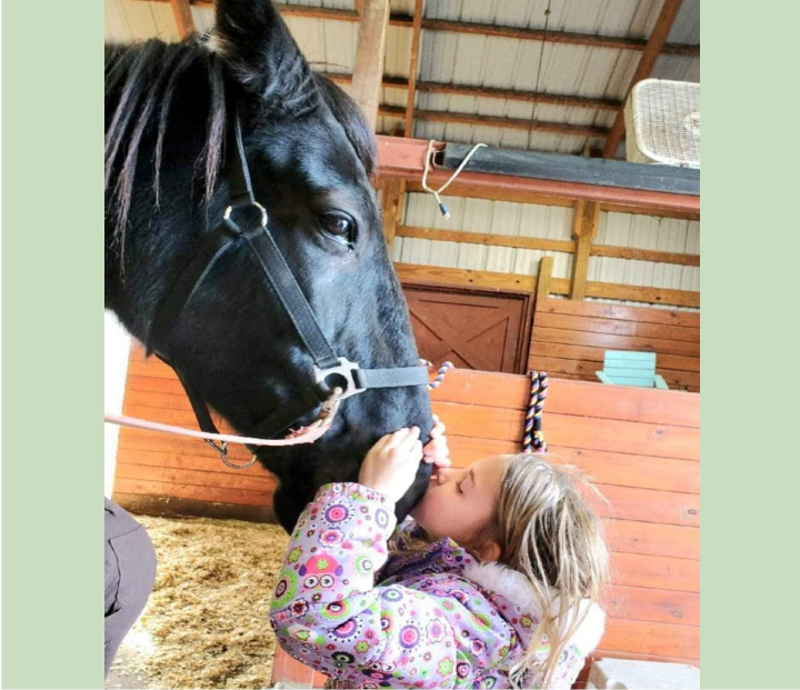
Airliner is in love too~ We never forget our first kiss and our first horse!