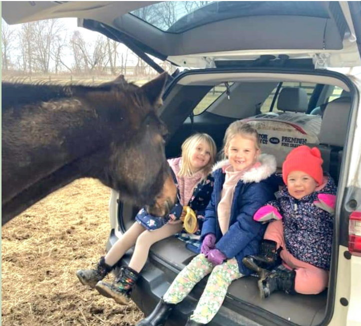
OMG, he ducked his head under the tailgate to play with the kids. Cuteness overload!