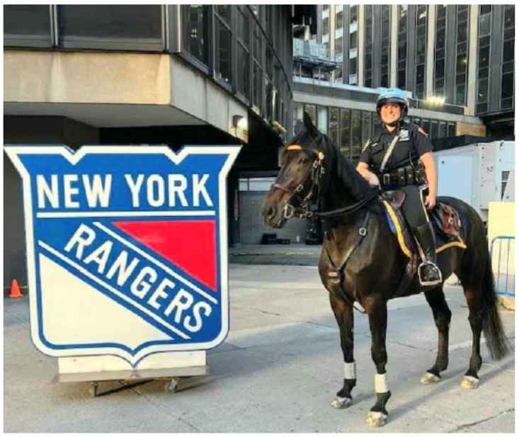
Proud of SRF's horses with the NYPD working at Madison Square Garden in New York City. Genius Again gets the job done every time!

This is the first effort of its kind by the 33-year-old organization. SRF is grateful to the many veterinarians and others who gave their time to bring this powerful educational seminar to this area. There are many expenses related to this first of many events to come, yet there is no funding available for it. SRF is feeding and caring for more than 500 horses every day, and so many others need help, but it is very important to address these other needs for the same reason, the welfare of these animals. To do so, SRF very much appreciates tax-deductible gifts for this important effort.