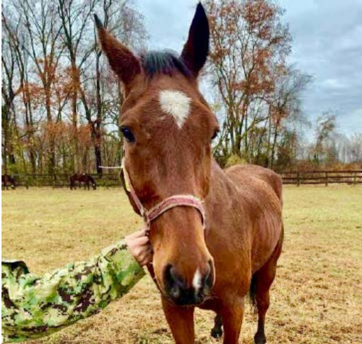
Trooper upon arrival at SRF.