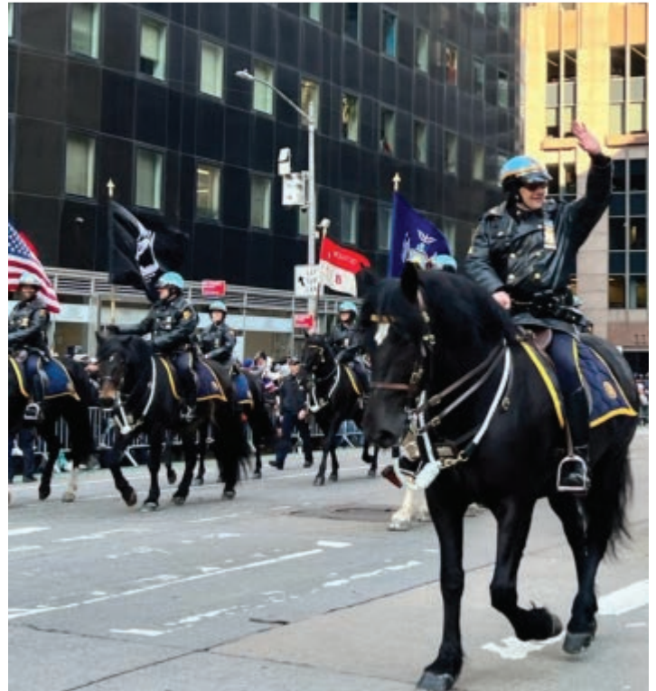
Prouder, no one could be! This is the Macy's Thanksgiving Day Parade. SRF's adopted horses keep the peace with the New York City Mounted Unit, Newark Mounted Patrol, Philadelphia Mounted and Rockland County, NY.