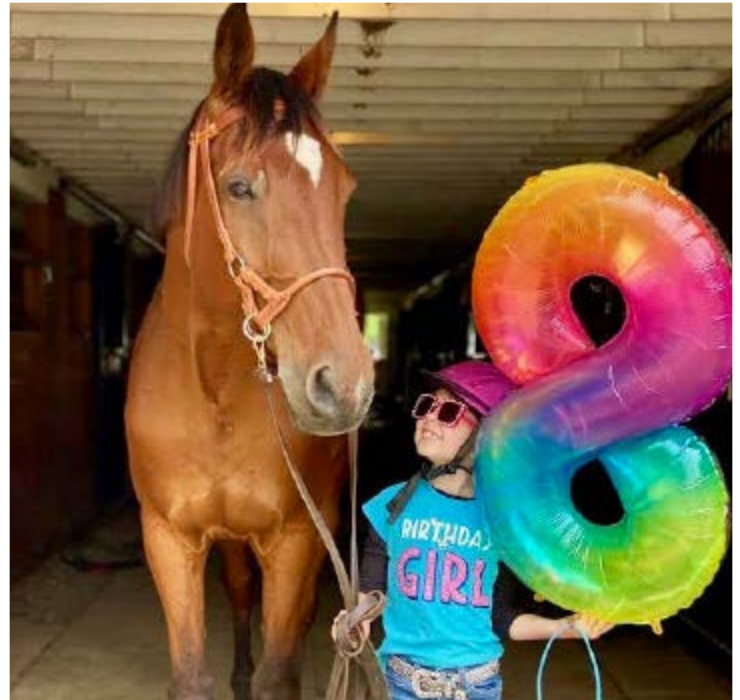
Trooper enjoying his new life.

Here is Trooper when SRF took him in from the slaughter line, and here he is with one of his very many girlfriends at her birthday party!