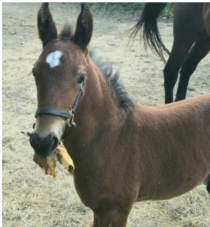
A surprise arrival! Imagine the staff's stunned faces when they came to work to find 8 horses in the field surrounding a brand new colt! Story on page 2.

The remaining are either with SRF presently or have found loving homes. SRF will still remain their guardian, how SRF is different. Thank you for saving their lives. Seven-hundred-forty-nine is exclusive of all the horses SRF helped right from the racetrack.